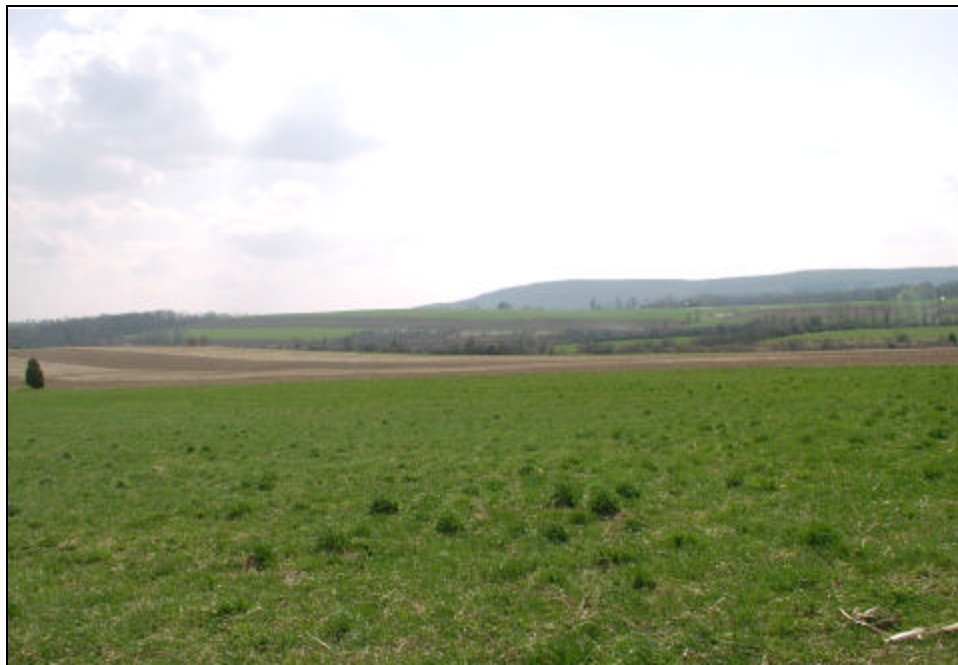
Figure 2: Glacial influences set the stage for soil management groups.

These soils are low in K-supplying power and are coarse- to moderately coarse textured soils formed from glacial till or glacial outwash (Figure 2). There is no subdivision of the soil management IV. The soil texture is sandy loam or silt loam in the surface, with or without gravel. The subsurface ranges from gravelly loam to clay textured. The slopes vary from level to strongly undulating. The somewhat poorly to poorly drained soils of this group can usually be drained effectively with widely spaced tile lines.